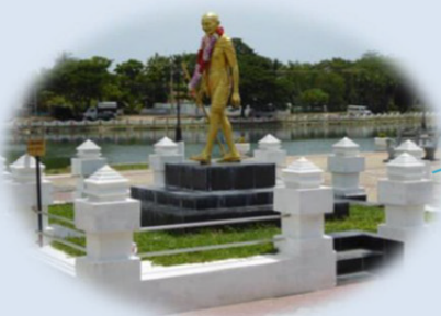
Mahatma Gandhi Park