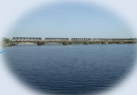
Lady Manning Bridge